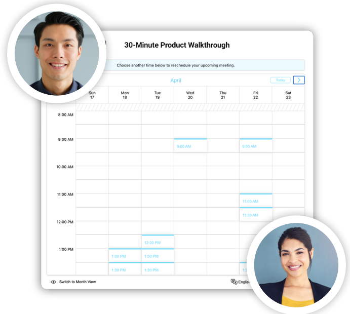
Instantly present your prospect a selection of meeting times

BookIt not only accelerates your lead conversion, but it also delivers a more compelling experience for every prospect.